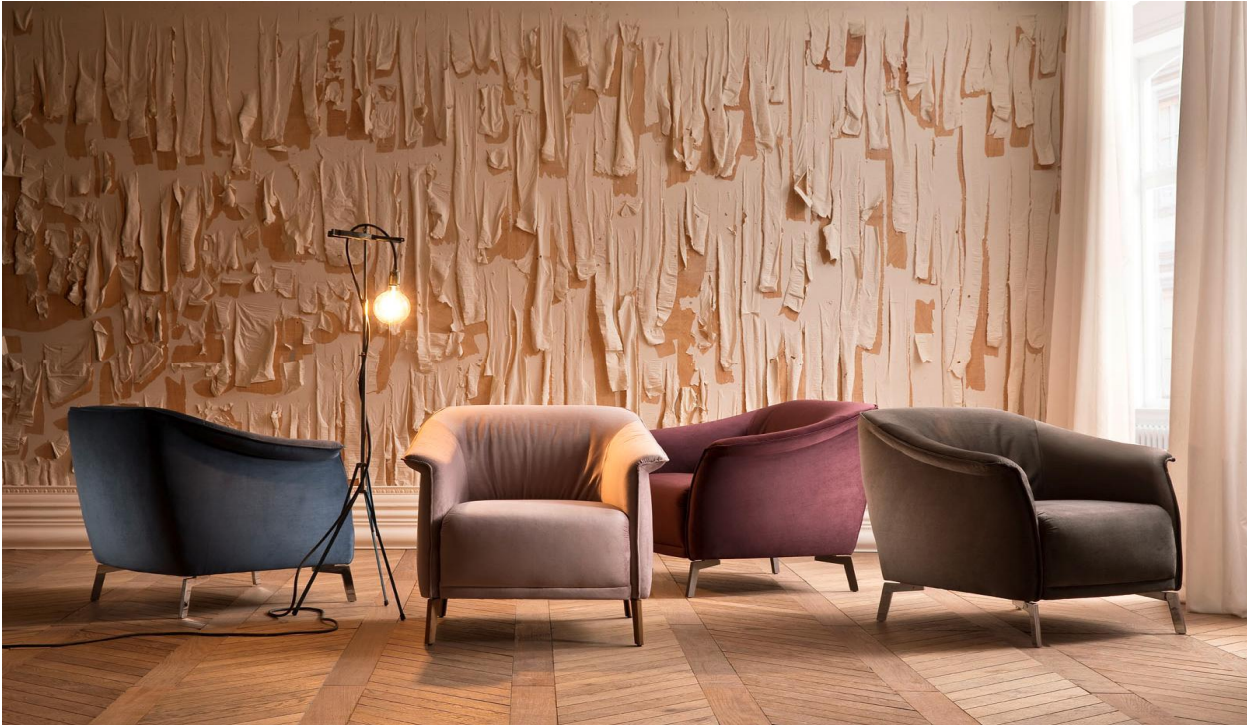
Armchair in Velvet blue grey, rosewood, purple and stone